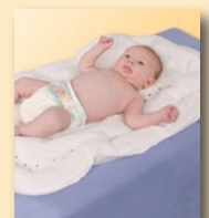
TC2061 Pediatric Under and Over Body

Gaymar provides a comprehensive range of Temperature Management and Pressure Ulcer Management products. To order or inquire about our product lines, call Gaymar's Customer Service Department at 1.800.828.7341