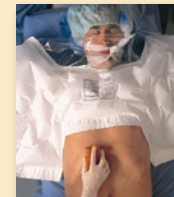
TC2052 Upper (OR)