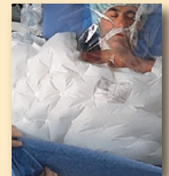
TC2054 Torso (OR)