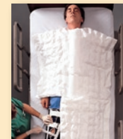
TC1050PACU (Recovery) Full Body

The Thermacare system includes a TC3000 Warm Air Blower Unit and a Thermacare Quilt. Accessory Stand THCS is optional.